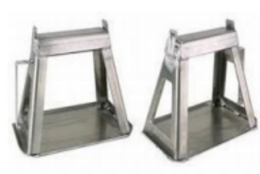
Exhibit 2: Transponder Mounting Location